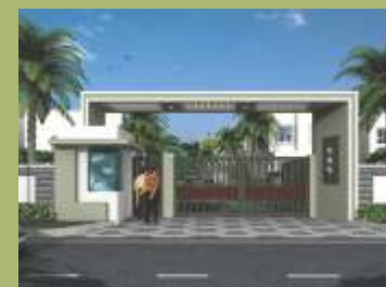
Villas @ KR Puram