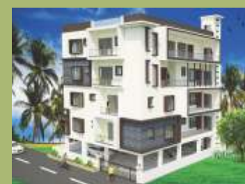
Prakruthi Apartments @ Jakkuru