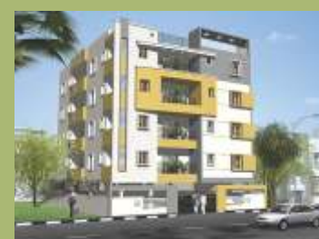
JMD Home @ KR Puram