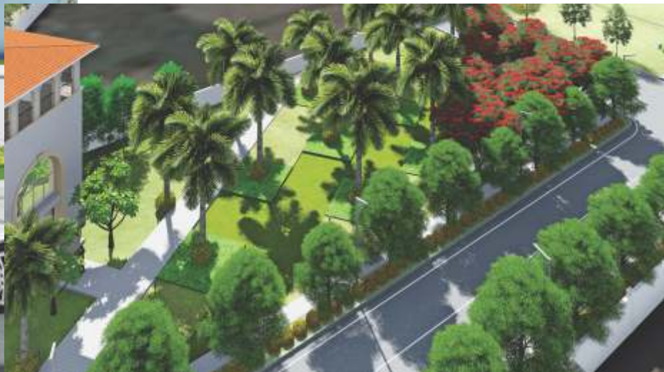
Calm, senior citizens zone.

Modern conveniences are a plenty. One can access all the facilities and amenities available and experience a feeling of luxury in this impeccably planned development.