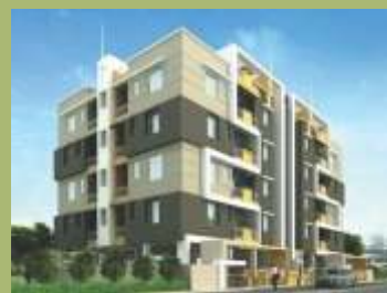
Apartments @ KR Puram, Next to Krishna Theater