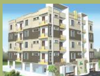
KVM Apartments @ KR Puram