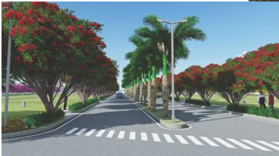
Beautiful tree lined boulevards.

Your children can enjoy life's pleasures without a care and you can breathe in clean, crisp air as you take a walk or jog amidst lush green trees at AB Gardenia, which is also dotted with 6 beautifully landscaped parks.