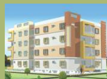
JMD Enclave @ KR Puram