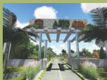
Sree Sai Aero City @ Sadahalli